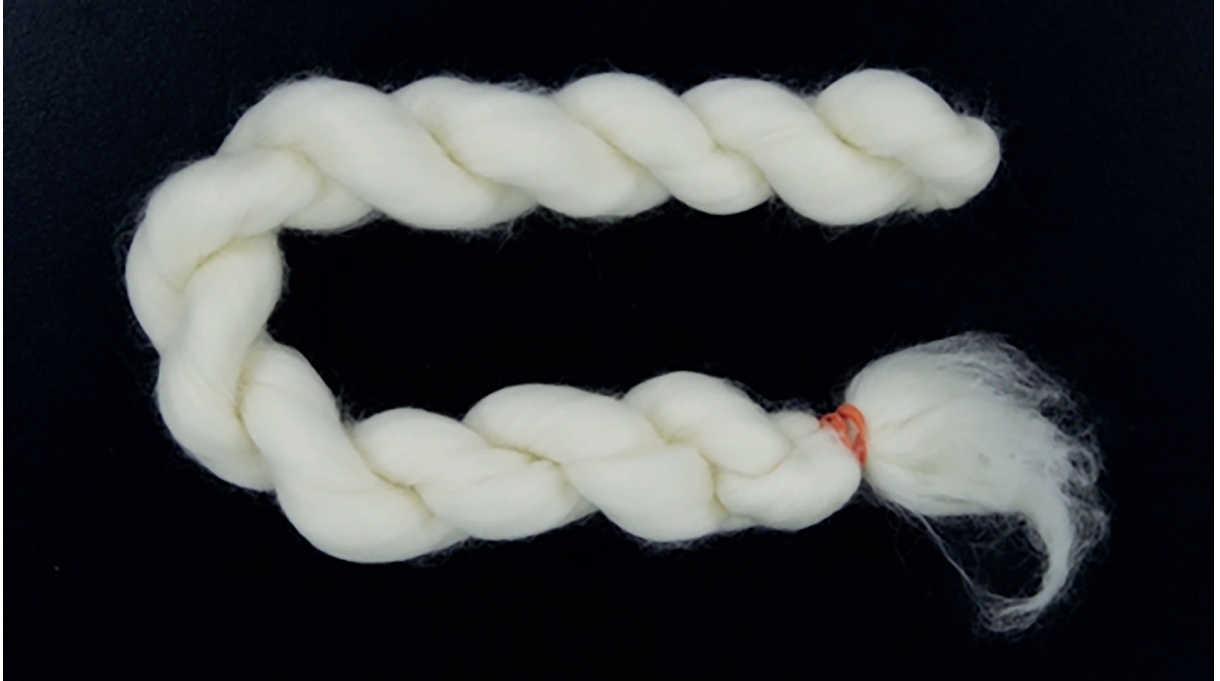
Figure A.2 — Incorrect prepared sample