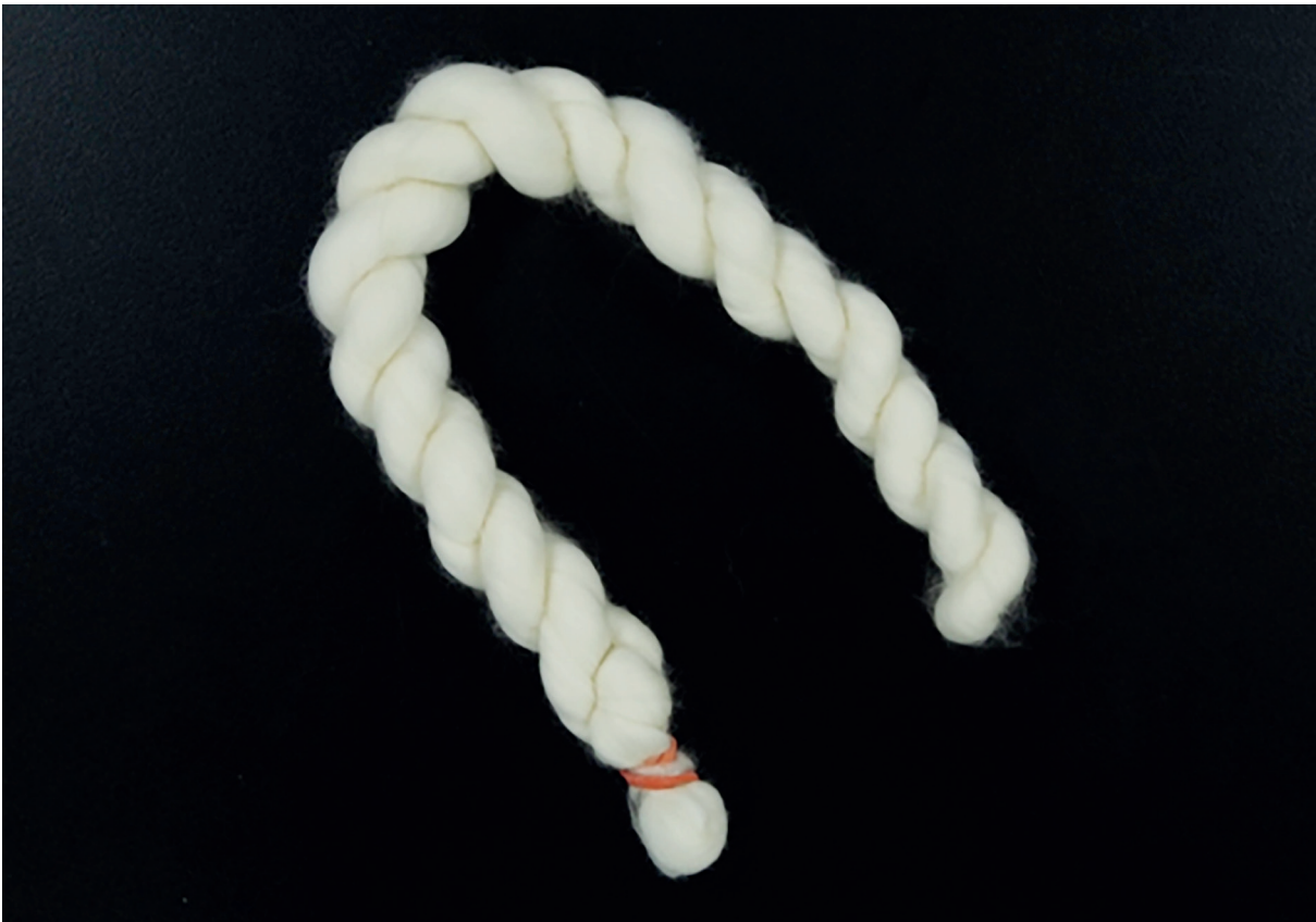
Figure A.1 — Correct prepared sample

Incorrectly prepared sample as shown in Figure A.2 shall be released and reprepared.